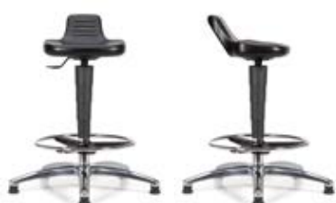
ASTREO PG. 13