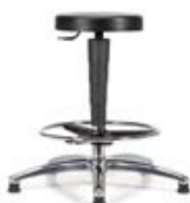
MILETO PG. 15