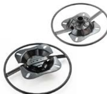
SM0104015 170x170 mm stool plate made of steel sheet with ring for gas spring activation. Piastra per sgabello in lamiera d'acciaio 170x170 mm con anello per comando gas.