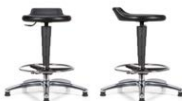
PAROS PG. 14