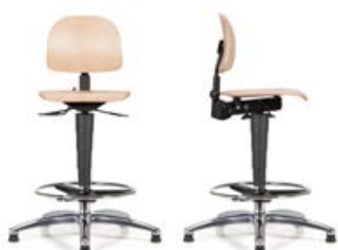
MEMPHIS WOOD PG. 8