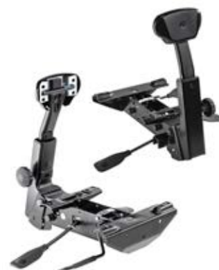
SM4552015 Asynchron mechanism with three levers and knob for back height adjustment. Meccanismo asynchron a tre leve con volantino per regolazione altezza schienale.