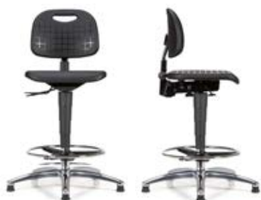
MEMPHIS PU PG. 4