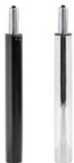
SF3350515 (black/nera) SF3350502 (chrome/cromata)

H.375 gas column. Colonna a gas H.375 mm.