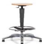
SPARTA PG. 16