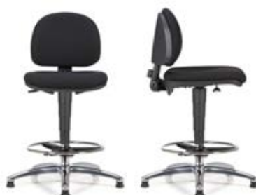
MEMPHIS UPHOLSTERED PG. 7