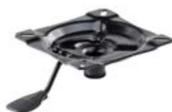
SM0102015 170x170 mm stool plate made of steel sheet with lever for gas spring activation. Piastra per sgabello in lamiera d'acciaio 170x170 mm con leva per comando gas.